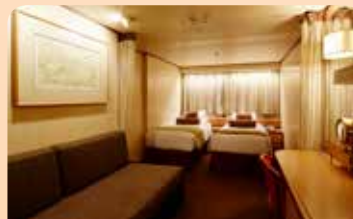
Standard Twin Inner Cabin Included in your package

Why not upgrade your cabin to one of 19 categories of cabin, right up to the magnificent Royal Penthouse Suite. Simply ask. Packages are based on the Standard Twin Inner cabin with private en-suite facilities (twin or double beds). Example upgrade costs: