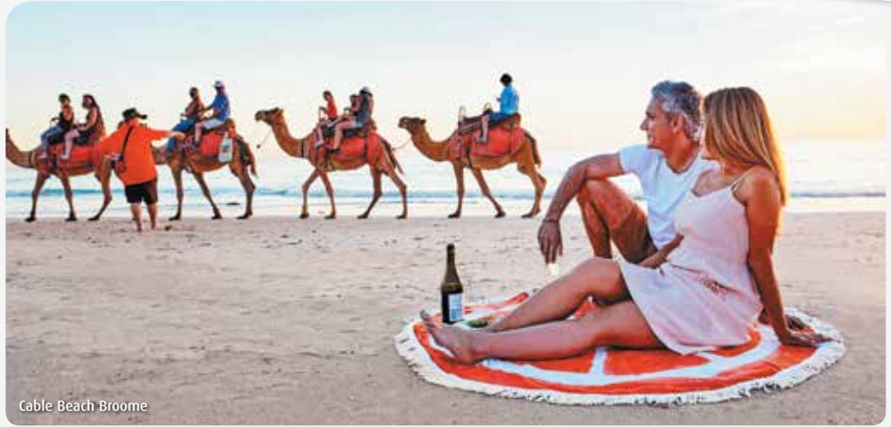
Cable Beach Broome