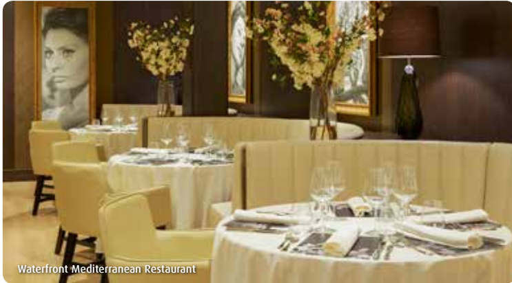
Waterfront Mediterranean Restaurant