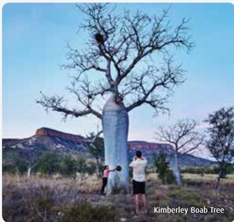
Kimberley Boab Tree

Experience a port of call in Geraldton, located on the beautiful Batavia Coast. This seaside city is emerging as a trendy beach escape. Blessed with beautiful inner-city beaches and a warm, windy climate, it is up there with the top must-see surfing, kite surfing, windsurfing, diving, snorkelling, boating and fishing destinations in Australia. Besides a buzzing modern foreshore that offers shopping, dining and lively entertainment, Geraldton has established itself as a trendy seaside city with the emergence of cold-brew coffee, street-art and plenty of other great experiences. Take a moment to immerse yourself in the touching HMAS Sydney Memorial.