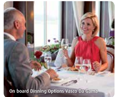
On board Dining Options Vasco Da Gama