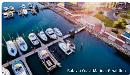
Batavia Coast Marina, Geraldton