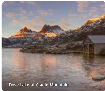
Dove Lake at Cradle Mountain