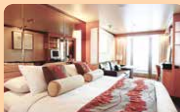
Superior Balcony Cabin from $130 per night, per person