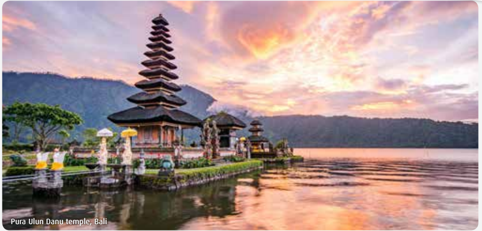
Pura Ulun Danu temple, Bali