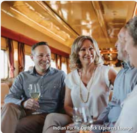
Indian Pacific Outback Explorers Lounge

Cruise two of the world's greatest oceans. The Indian Ocean and the Southern Ocean.