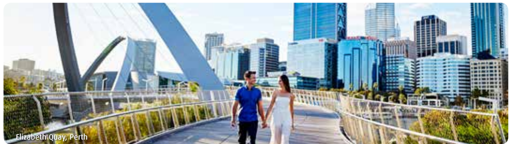
Elizabeth Quay, Perth