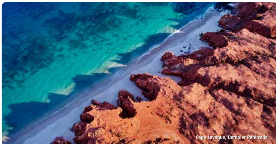
Cape Leveque, Dampier Peninsula