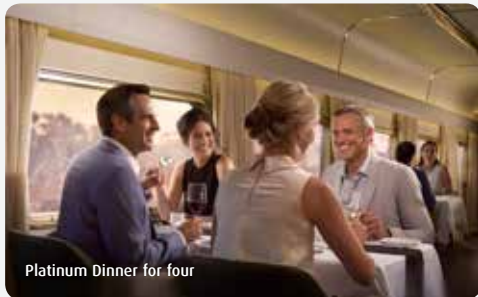
Platinum Dinner for four

Our Burnie port of call is the gateway to Tasmania's beautiful and spectacular north, including Cradle Mountain. It is a port city with an industrial past that has reinvented itself as a vibrant and creative city on a beautiful stretch of Tasmania's North West Coast. Nestled around Emu Bay on Bass Strait, Burnie has been an industrial centre for most of its existence. Since the closure of its paper pulp mill, the city has taken a creative approach to promoting itself and the many makers who call it home.