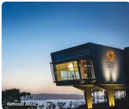
National Anzac Centre