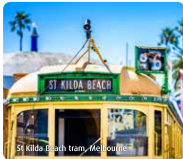
St Kilda Beach tram, Melbourne