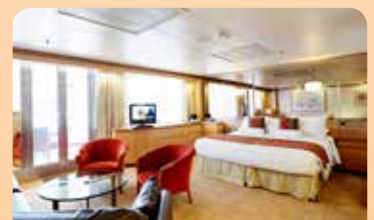
Deluxe Suite from $246 per night, per person