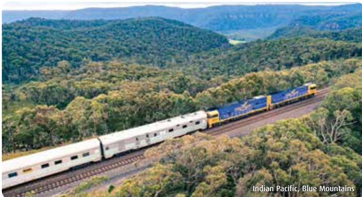
Indian Pacific, Blue Mountains