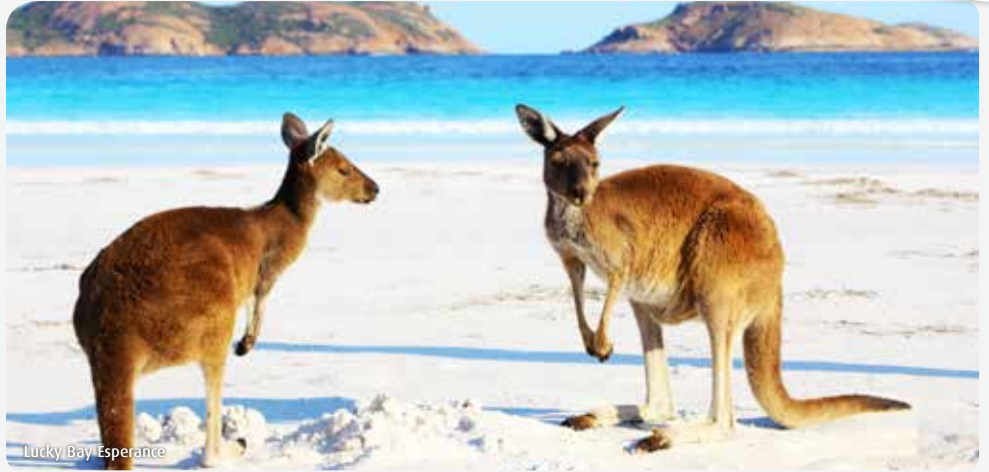
Lucky Bay Esperance