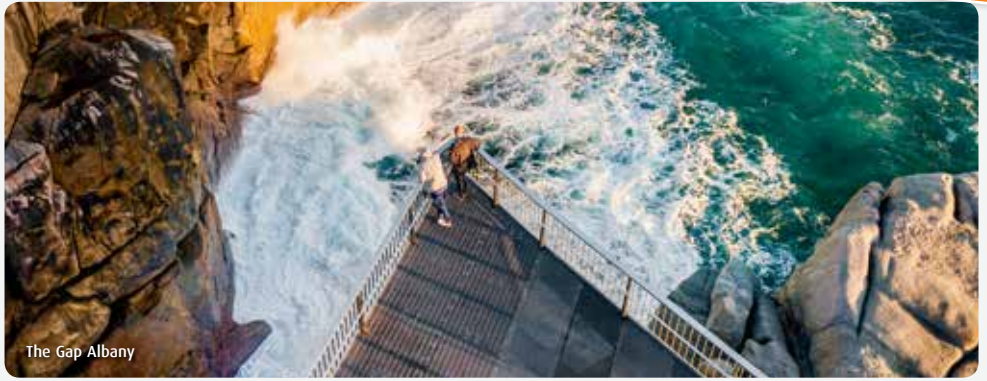
The Gap Albany

Adelaide to Fremantle Vasco da Gama Cruise with Indian Pacific 10 Day Train + Cruise Package Combine the Indian Pacific with a premium 5 day Adelaide to Fremantle cruise aboard the stylish Vasco da Gama (port of call in Albany). Journey from Sydney to Adelaide on the Indian Pacific, spend 3 nights in Adelaide followed by 4 nights aboard the contemporary Vasco da Gama enjoying a classical cruising style from Adelaide to Fremantle (stopping in Albany). The ex Perth option is 12 days travelling Perth to Adelaide on the Indian Pacific.