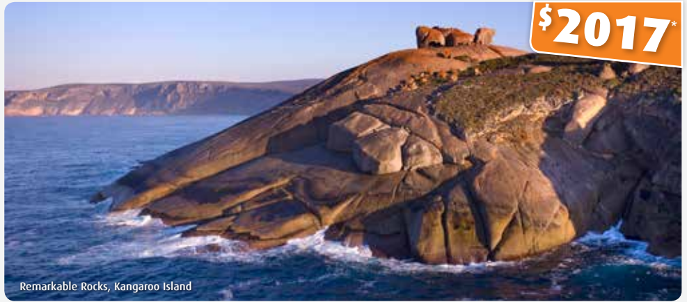
Remarkable Rocks, Kangaroo Island