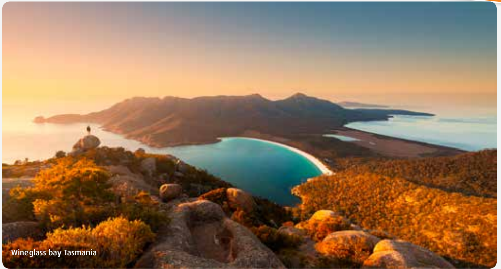
Wineglass bay Tasmania