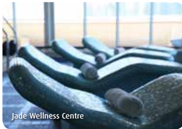
Jade Wellness Centre