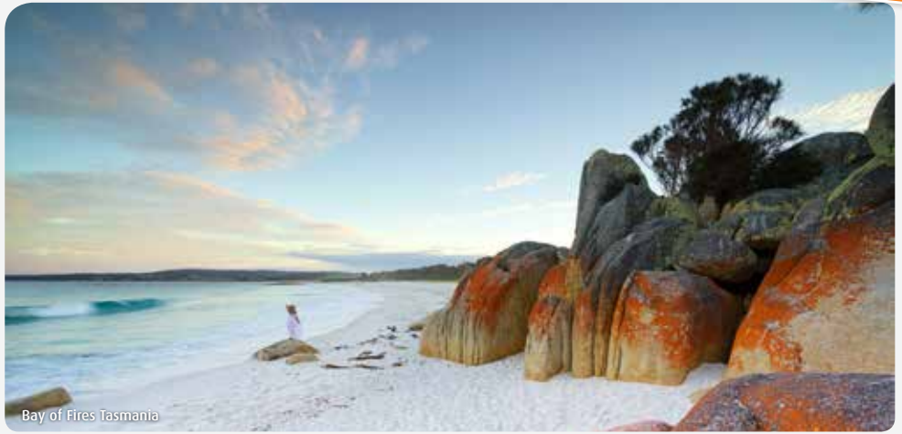
Bay of Fires Tasmania