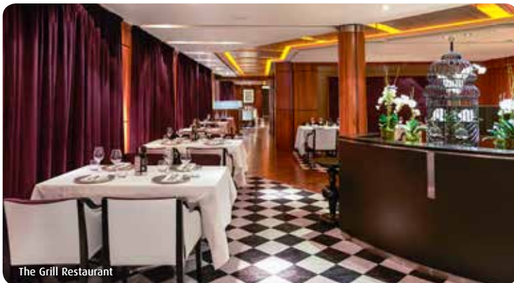
The Grill Restaurant

Relax aboard the premium Vasco da Gama with all of this included in your package: FREE meals throughout the day from a choice of restaurants. FREE afternoon teas, late night snacks and self-service tea and coffee. Experience FREE onboard big show entertainment, cabarets, and classical interludes. Choose from a range of FREE daytime activities and guest lecture programmes (selected sailings) and enjoy all onboard leisure facilities. Package includes a stylish inner cabin but you can upgrade to a range of cabin options, simply ask.