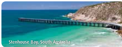
Stenhouse Bay, South Australia

Combine the Indian Pacific with a premium 3 day Southern Icons cruise aboard the stylish Vasco da Gama from Adelaide (port of call in Port Lincoln). Enjoy a classic traditional cruising style with a premium contemporary fit-out as you cruise the dramatic South Australian coast from Adelaide. Journey aboard the Indian Pacific from Sydney to Adelaide and cruise from Adelaide aboard the Vasco da Gama (port of call in Port Lincoln). Spend a night in Adelaide before your 2 nights aboard the Vasco da Gama from Adelaide, stopping at Port Lincoln. The ex Perth option is 9 days travelling Adelaide to Perth on the Indian Pacific.