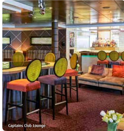
Captains Club Lounge