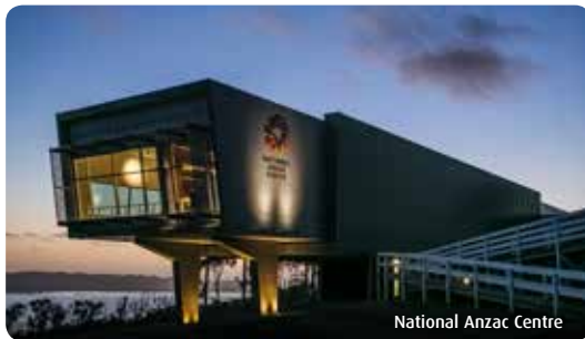
National Anzac Centre