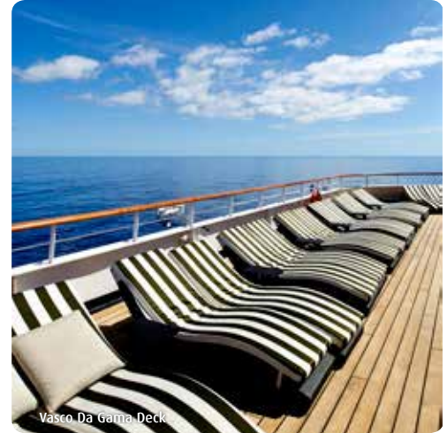
Vasco Da Gama Deck