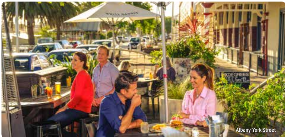
Albany York Street