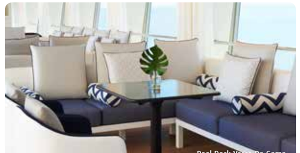
Pool Deck Vasco Da Gama