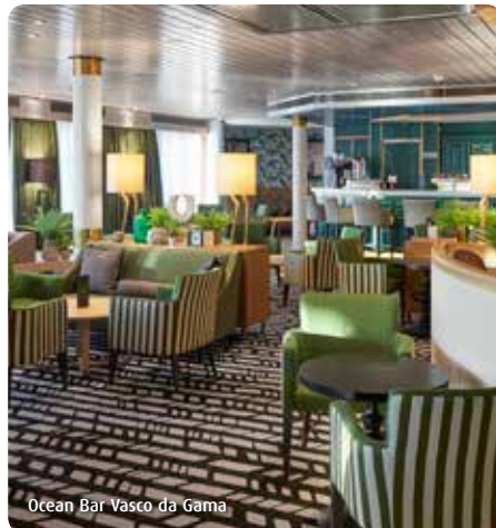
Ocean Bar Vasco da Gama