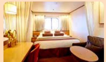
Standard Twin Ocean View Cabin from $33 per night, per person