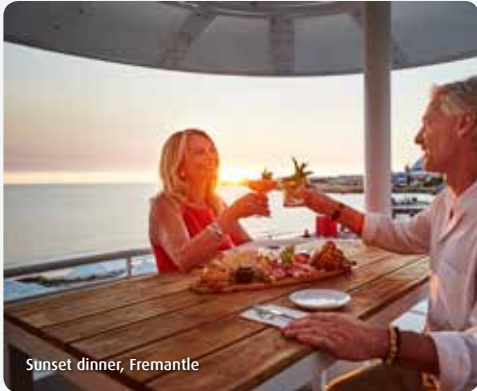
Sunset dinner, Fremantle