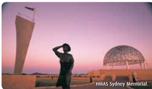
HMAS Sydney Memorial.