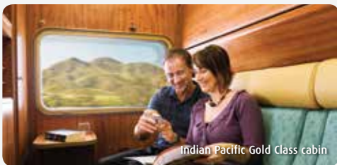
Indian Pacific Gold Class cabin